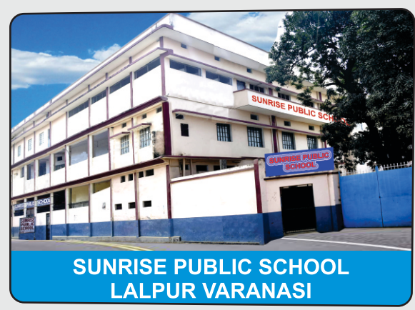
SUNRISE PUBLIC SCHOOL LALPUR VARANASI